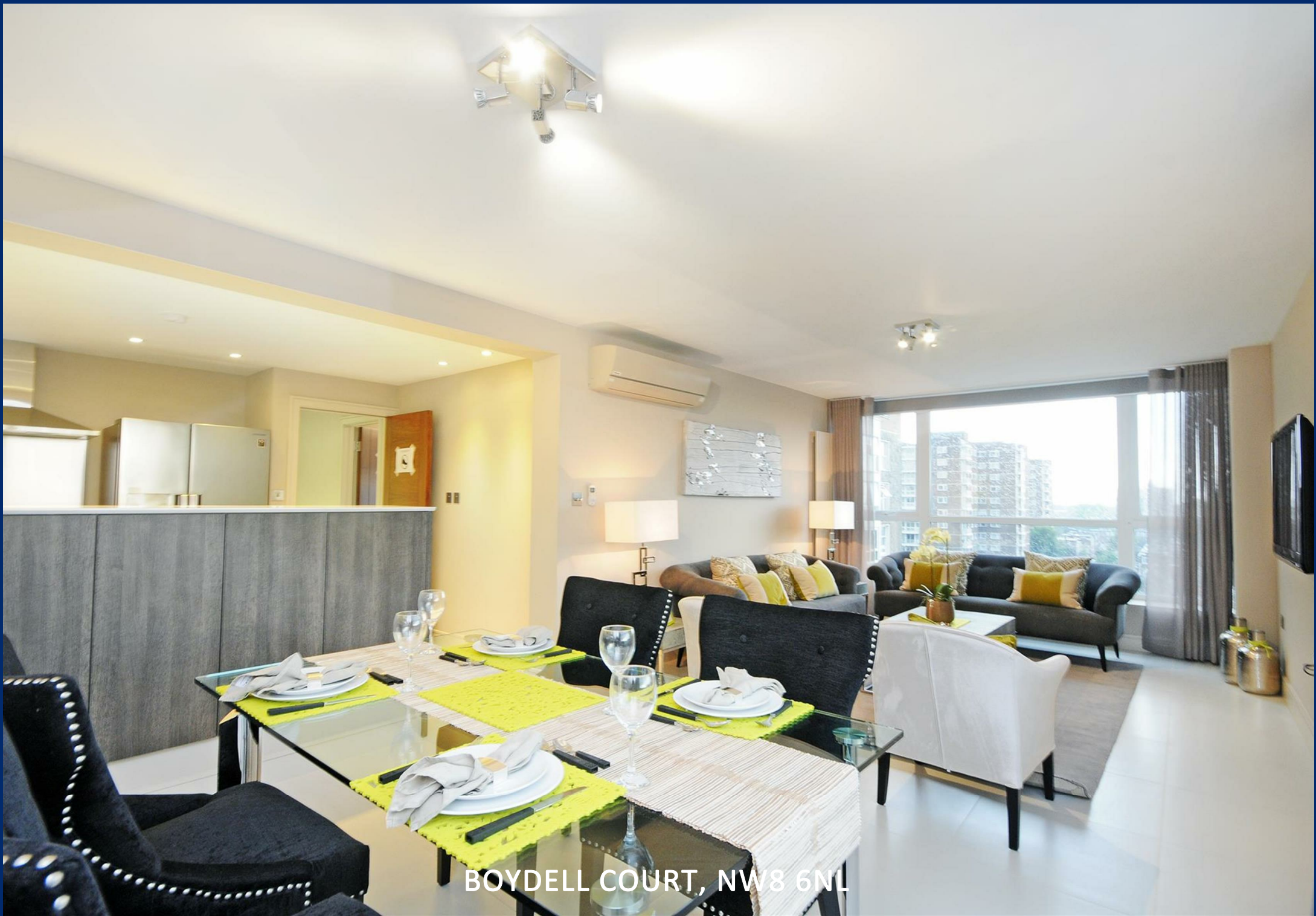
BOYDELL COURT, NW8 6NL